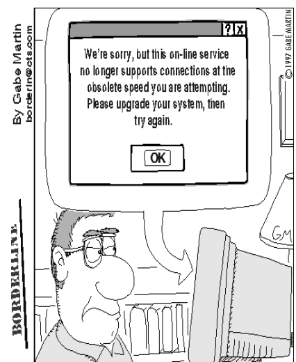
The Ultimate Technological Slap in the Face.

but with the support of the US office, WINcustomers UK has been a complete success. WINcustomers UK is now recruiting for sales and marketing staff; initially these will be work-at-home positions around the UK and possibly Europe. As with WINcustomers (US) the focus is always on new ideas and any new employees would be encouraged to work on their own initiative. If you are interested in applying email your resume or CV to recruit@wincustomers.com .